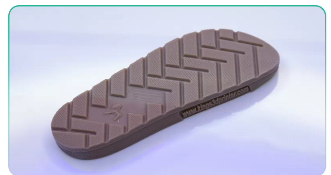
ABS Like SLA Resin KS908C