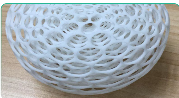
Durable ABS Like Resin KS408A