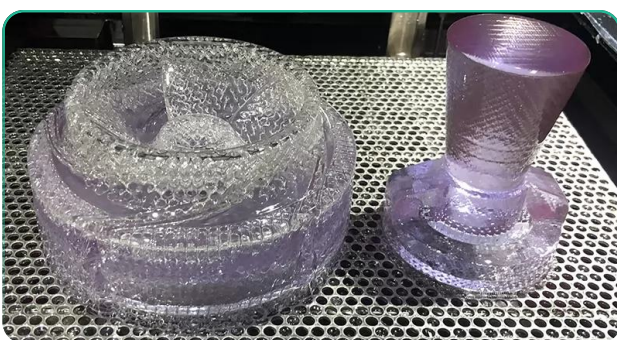
Clear SLA Resin UV Resin KS168C