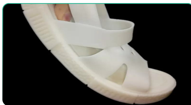
Rubber like UV Resin KS198S