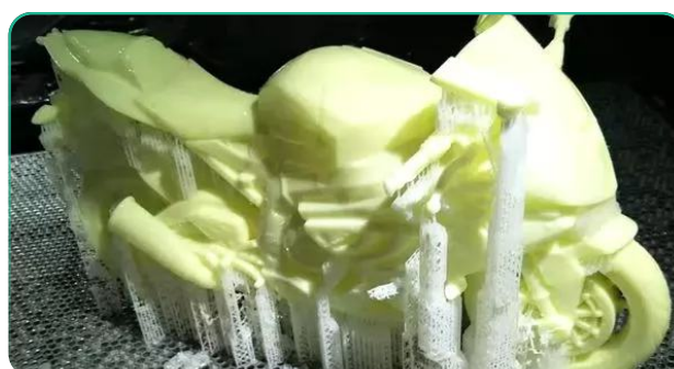
High toughness ABS Like Resin KS608C