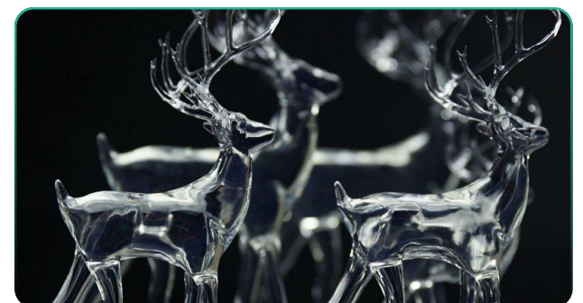
Clear UV Resin KS158T