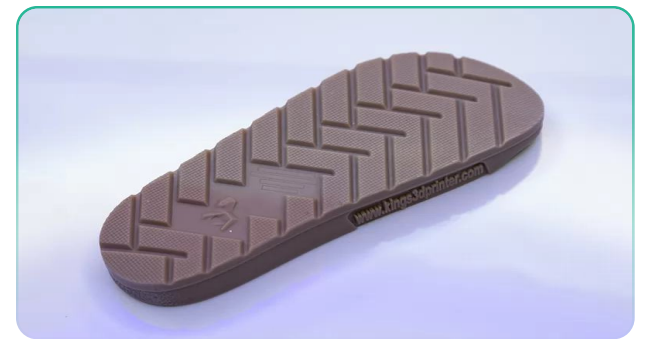
ABS Like SLA Resin KS908C