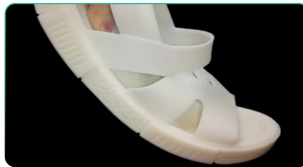
Rubber like UV Resin KS198S