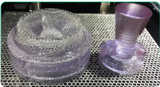
Clear SLA Resin UV Resin KS168C